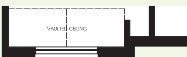
PARTIAL SECOND FLOOR - ELEV. A